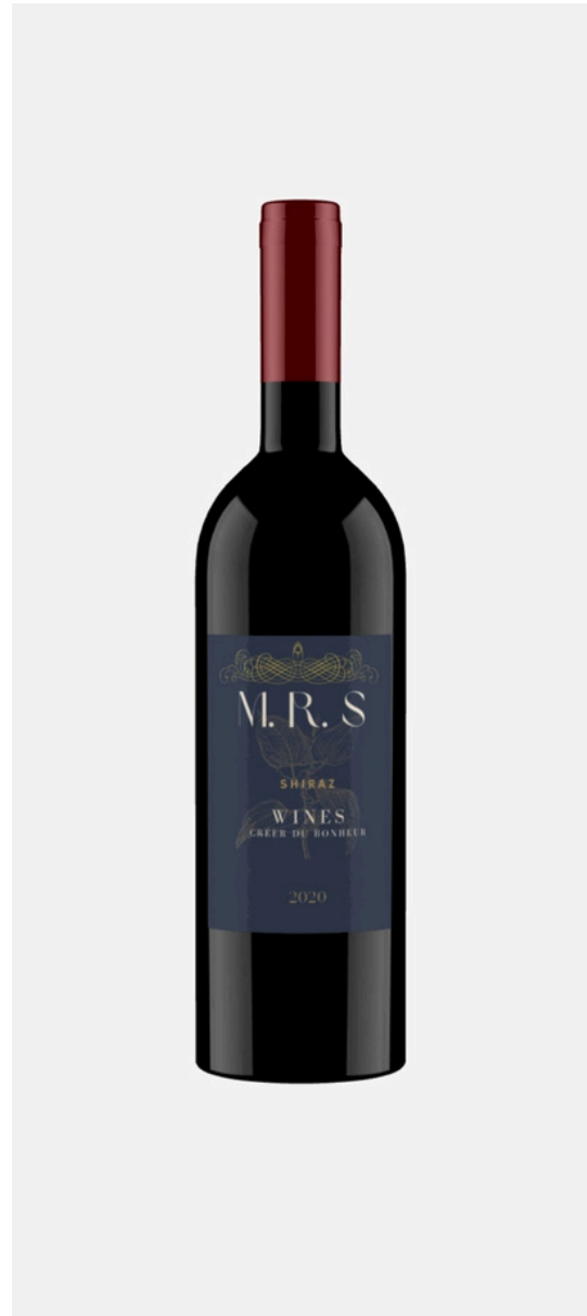
M. R. S Wines